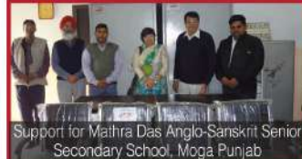
Support for Mathra Das Anglo-Sanskrit Senior Secondary School, Moga Punjab