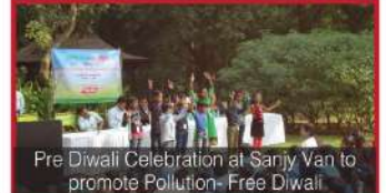
Pre Diwali Celebration at Sarjy Van to promote Pollution-Free Diwali