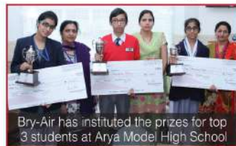
Bry-Air has instituted the prizes for top 3 students at Arya Model High School