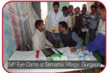
54 th Eye Camp at Sirmathla Village, Gurgaon