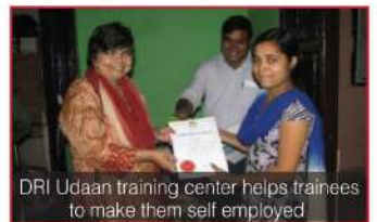
DRI Udaan training center helps trainees to make them self employed