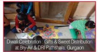
Diwali Celebration : Gifts & Sweet Distribution at Bry-Air & DRI Pathshala, Gurgaon