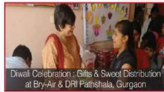
Diwali Celebration : Gifts & Sweet Distribution at Bry-Air & DRI Pathshala, Gurgaon