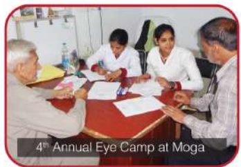
4 th Annual Eye Camp at Moga